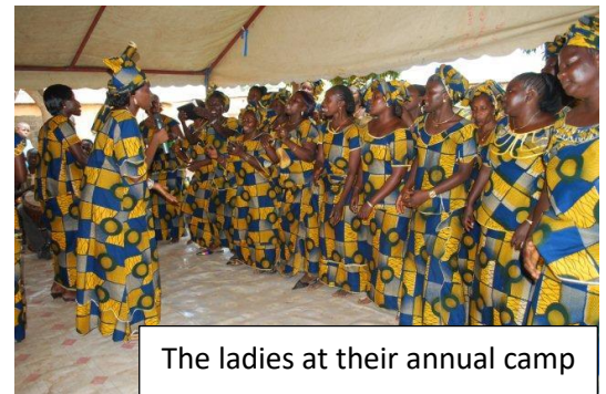
The ladies at their annual camp

-The Ladies' group: the Mouvement des Femmes. This is very active in the church (often the most dynamic of the groups around the evangelical