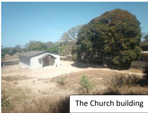
The Church building

-The Young people: La jeunesse – There are many young people linked to the church but their presence at the church depends on the time of year as many will go to high school in the regional capital called Ziguinchor (2hr drive away by bush taxi) and Universities long distances away.