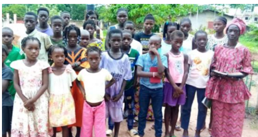
The children ready for their annual camp

churches!) many of the ladies are old and uneducated. They may have actually received the gospel from the earliest WEC missionaries who went to live amongst them (70-80 years ago). The financial support from Whitefriars enables this group to gather together, subsidising their costs both for travel and food, and enable them to worship together in their own language and with their own songs, to have Bible teaching, and to gain a sense of identity and fellowship together.